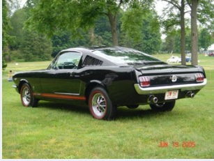
Chuck and Karen's 1965 Mustang at the Stan Hywet Father's Day Show June 2005