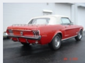
Our Newest CK Restoration Project - a very pretty '68 Mustang Convertible