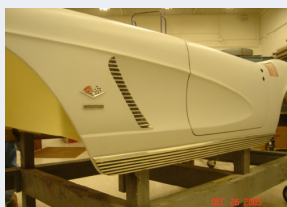
Final fit for the '62 Corvette's Fuel Injection badges and cove trim.