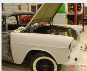
The '55 Chevrolet starts 2006 with all its body work completed and in primer.